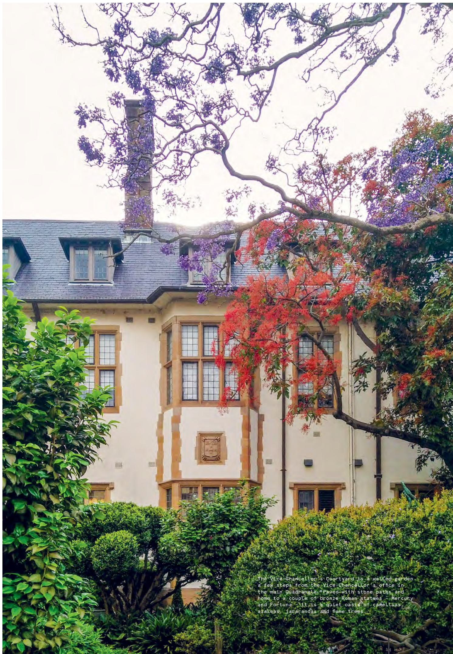
The Vice-Chancellor's Courtyard is a walled garden a few steps from the Vice-Chancellor's office in the main Quadrangle. Paved with stone paths and home to a couple of bronze Roman statues - Mercury and Fortuna - it is a quiet oasis of camellias, azaleas, jacarandas and flame trees.