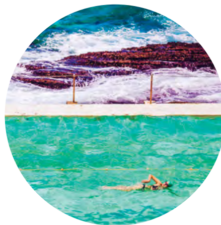
Images of Australia: Bondi beach; Uluru; Sydney Opera House; Bondi Icebergs outdoor pool; Great Barrier Reef

Australia offers a unique opportunity to engage with Asian, American and European markets. Sydney in particular is a hub of research and innovation activity, showing how industry, universities and government can work together, and a centre of business; around 60% of all Asia-Pacific regional headquarters are in Sydney.