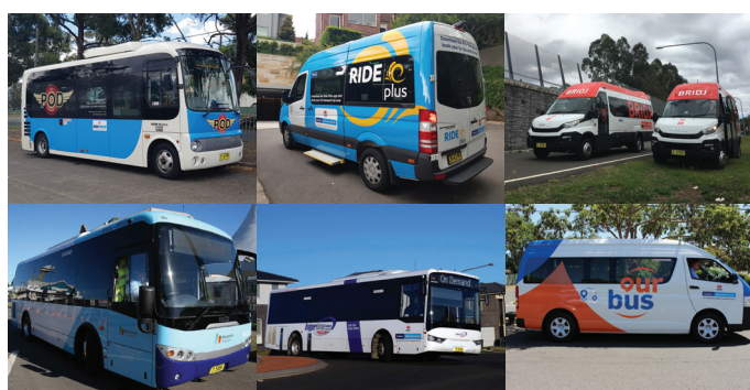
Figure 2: A selection of on demand pilots operating in Greater Sydney. Clockwise from top left, Punchbowl Bus Company's Punchbowl On Demand (POD), Transdev's Ride Plus, Transit System's BRIDJ, ComfortDelGro's OurBus, Interline Bus Services' Interline Connect and Keolis Downer's Newcastle Transport On Demand.

many don't), or are simply in the game to impress Transport for NSW (given their interest in on demand) to aid their next round of contract renewal. Some operators are even developing their own on demand products independent of government though none have thus far been launched.