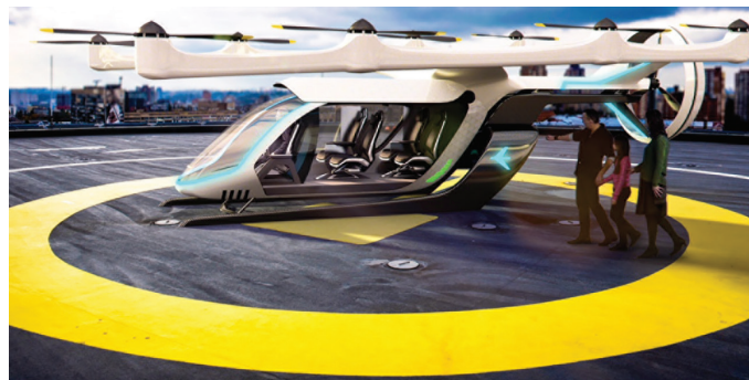
Figure 6: The Uber Elevate flying taxi concept, recently debuted by Uber and Embraer. The venture is now seeking three launch cities for uberAIR with demonstrator flights aiming to start in 2020 and commercial operations beginning in 2023

Beyond this, new technologies like Hyperloop (supported by Richard Branson and Elon Musk and active in Australia with a number of consultancies trying to bring the concept to market) will bring even greater disruption. Passenger drones or electric vertical take-off and landing (eVTOL) aircraft (prototypes are in development by Airbus, China's Ehang and Uber—see Figure 6) will bring urban transportation into the third dimension and a range of associated externalities. New regulations may be necessary permitting flight only above existing roads under a certain altitude. A major question is how ubiquitous these technologies will be and their cost to consumers—will it be for the many or the few? We are told all these ventures can operate commercially through the sale of data but how sustainable is this business model?