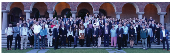
Figure 5: The 15th International Conference on Competition and Ownership in Land Passenger Transport (Thredbo 15) participants at Stockholm last year. Thredbo 16 will be held in August 2019 in Singapore—we invite the NSW bus and coach industry to join our unique policy forum on institutional and contracting reform

This idea is a major theme in a conference series ITLS has run for the past 30 years. The Thredbo series is the world's premier international conference on competition and ownership and it is extraordinary to chart how public transport contracting has evolved during this time. 4 In many cases, we have actually pre-empted where governments have moved in terms of the design and specification of contracts and their broader procurement mechanisms. In 2017, we held Thredbo 15 in Stockholm (Figure 5) where the 'uberisation' of public transport and MaaS became a hot topic and we brought together industry stakeholders around the world to workshop the nature of reforms in this space. Participants including regulators, operators and academics helped inform the design of what we call mode-agnostic mobility contracts which we have now taken into the market to test.