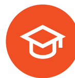
Advanced Skills for Academic Success (ASAS)