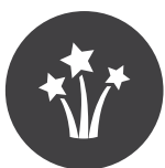
University Heroes App