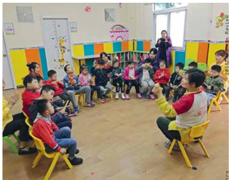
Singing time at the end of the school day