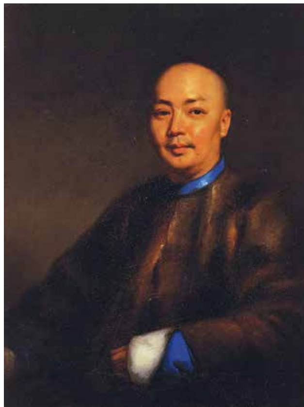
Lam Qua (1801–1860), Self-Portrait, ca. 1840s.

2018 marked the second year of the Sydney Asian Art Series, an ambitious initiative supported by the China Studies Centre, Power Institute Foundation for Art and Visual Culture, and VisAsia, in partnership with the Art Gallery of New South Wales and Sydney Ideas.