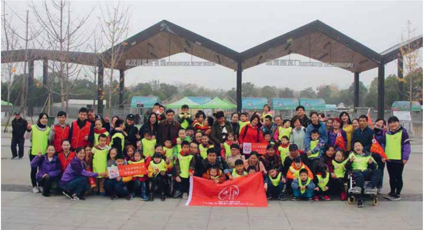
Children, their teachers and parents at the Wuhan Natural History Museum

An important goal of our research is to adapt our evidence-based family-centred measures to the Chinese cultural context. With the assistance of CCNU Master of Special Education students, we are implementing these measures to build a knowledge base about families of children with disability in China.