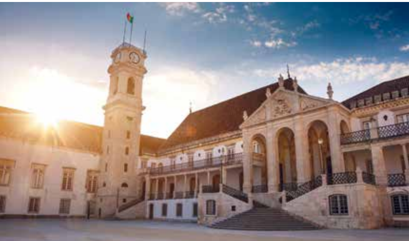
University of Coimbra, Portugal