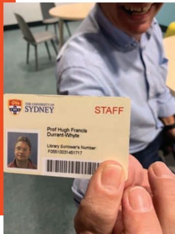
NSW Chief Scientist gives staff card details to access to the Sydney Knowledge Hub

The University of Sydney had over $3 mil in research income from collaborations with members. 40% of member organisations have collaborated with researchers at the University; 18 student work placements were facilitated