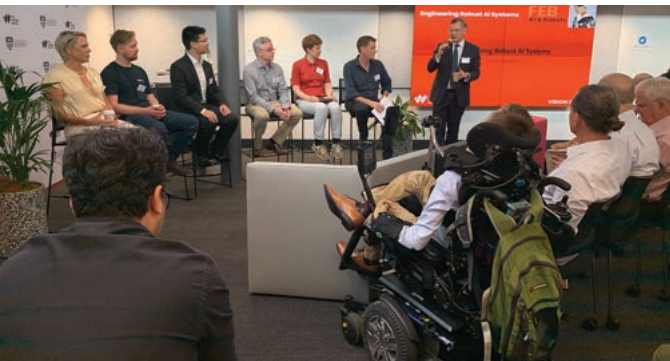
The Warren Centre and Gradient Institute hosting a panel on Engineering Robust AI Systems