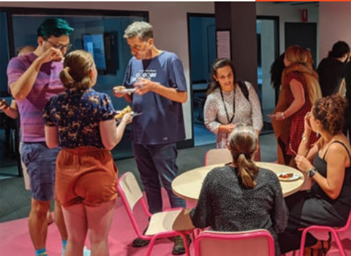
Member-focused events have created a sense of community