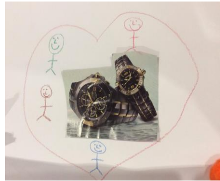
A birth mother depicts her heart's desire being to spend more time with her four children