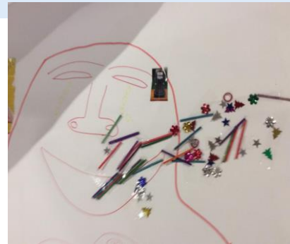
A birth mother depicts her wish to be seen & heard by carers & caseworkers at contact