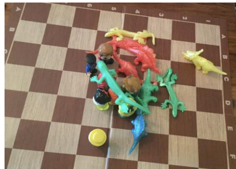
Child's representation of close relationships with carers and some birth family members, using figurines. Siblings living elsewhere are depicted as being less close.

If contact had to be suspended due to a child's severe distress, it was critical that birth parents were consulted and alternative strategies, such as regular phone contact, were used to maintain the connection. Creativity and sensitivity by carers could reassure birth parents they were not to blame. This showed birth parents that they were respected and that it was necessary to put the child's needs first.