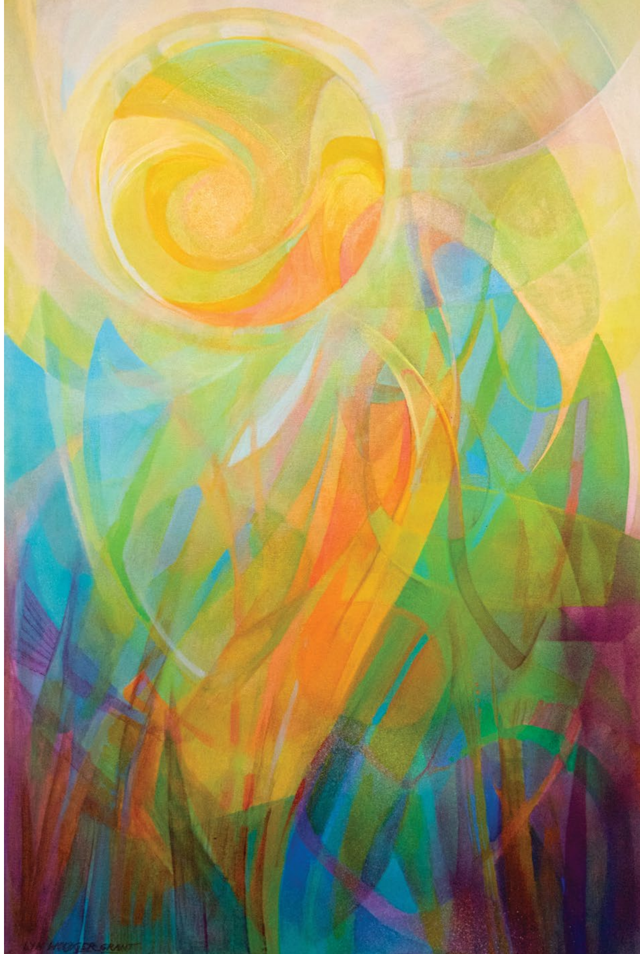
Lyn Woodger, Grant Ascension VII , 2015, acrylic on canvas 61x90cm