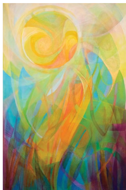
Above: Lyn Woodger, Grant Ascension VII , 2015, acrylic on canvas 61x90cm