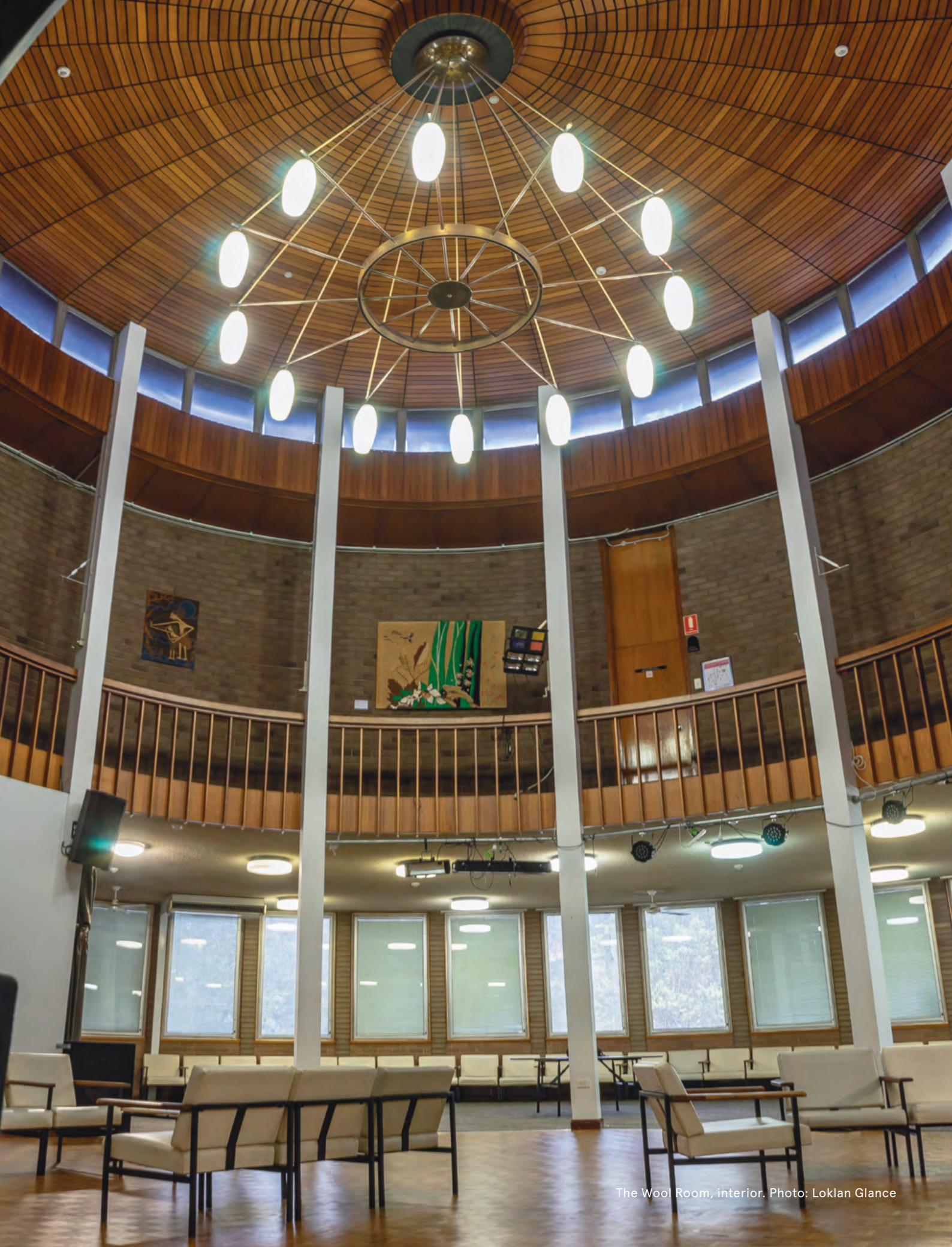
The Wool Room, interior.