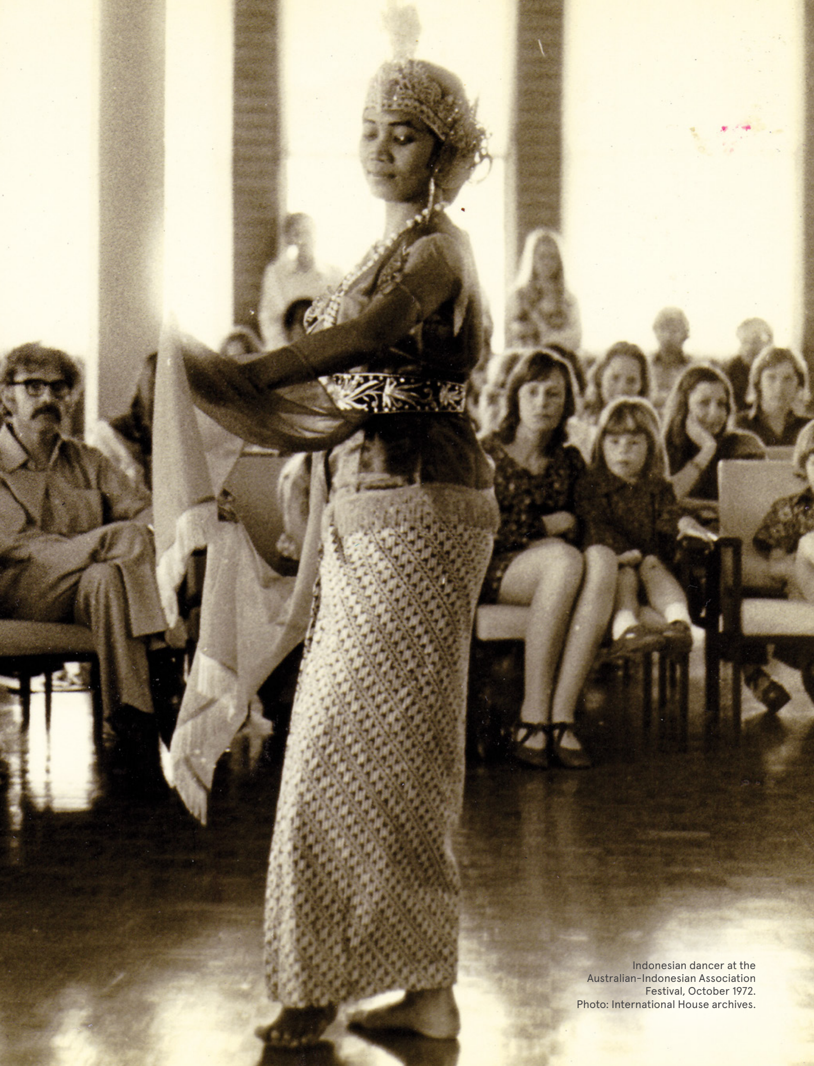
Indonesian dancer at the Australian-Indonesian Association Festival, October 1972.