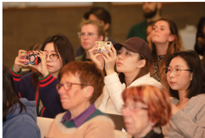
Below: Students take exacting notes using their smartphones.

harnessing the power of big data to get us out of some of the wicked holes we find ourselves in.”