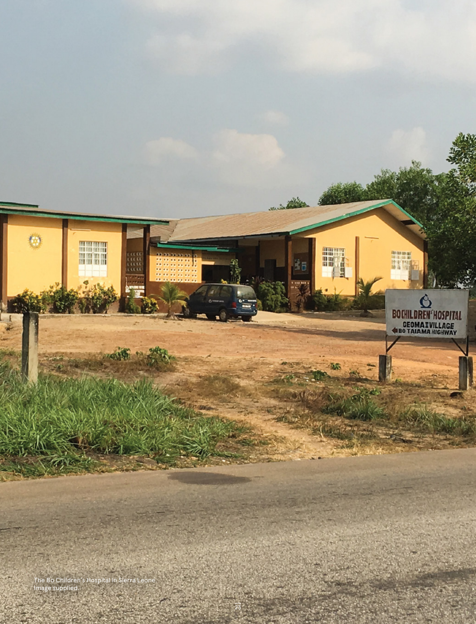
The Bo Children's Hospital in Sierra Leone.