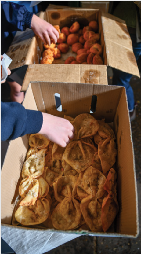
Students could sample authentic Afghan, Pakistani and Indian cuisine as part of their experience attending 'A Different View' events. Pictured are gosh-e fil and khajoor.

“Peace for me is founded on the belief that we may all look, speak and think differently, but ultimately we all feel the same. This is a uniting quality that should take us forward into the future.”