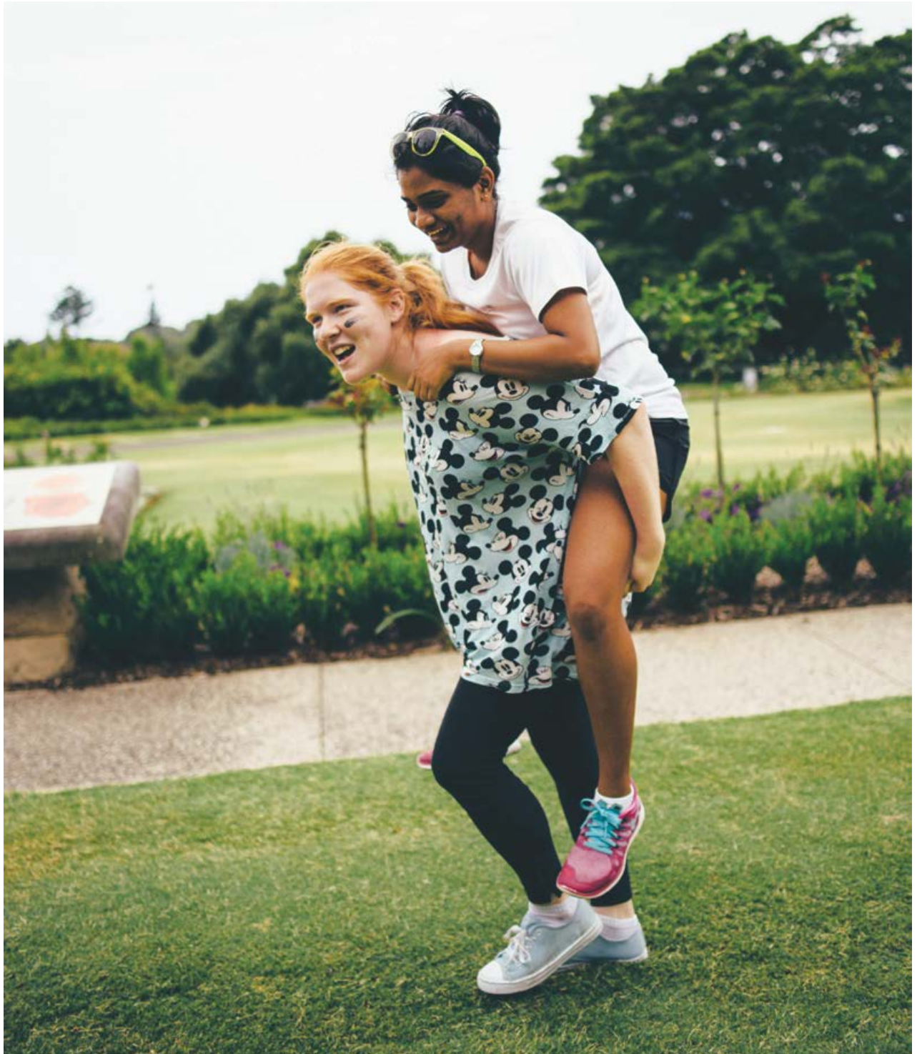
Orientation Week 2016