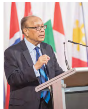
What we can do for the culture of peace .....04