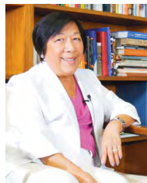
The real meaning behind global and diverse leadership .....26