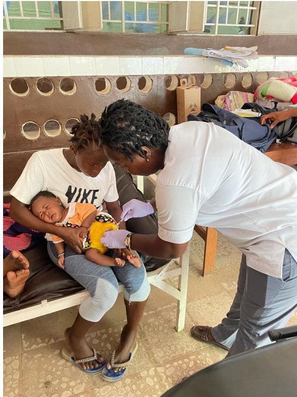
Child receiving a “marklate” from a nurse at the outpatients’ clinic

prevalent. Approximately 25% of deaths in children under 5 are due to malaria. BCH will add this to the immunisation program which vaccinates children under 5 against the major childhood diseases including Tetanus. (Every month there are still some deaths from neonatal tetanus, although numbers are declining with immunisation and safer birthing practices).