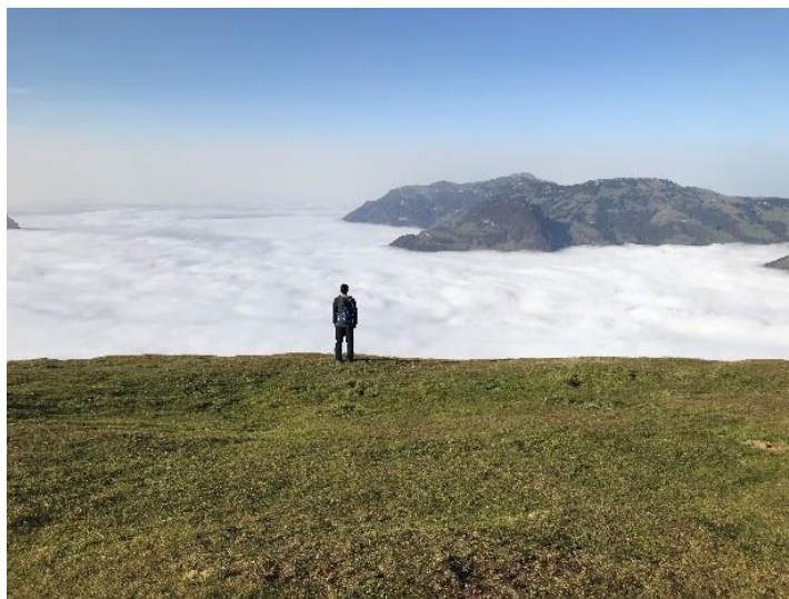
Photo: Wanderer above the Sea of Fog (7 November 2020 – Seelisberg, Switzerland)

The photo was named after the 19th century romantic painting by Casper David Friedrich. We shot the photo on the “Niederbauen” mountain in Seelisberg, which is situated just above the meadow where the mythological “Rütli Oath” is said to have taken place in 1307, calling into being the first Swiss Confederacy at the Lake Lucerne. [I had to translate the names from German, and there might therefore be differing accounts] We spent the day hiking, embracing the Swiss seasonal tradition of escaping the constant fog that settles below at that time of year. But it also marked a moment of peace and gratitude to be able to cherish this freedom (still), despite November marking the end of a summer of lax COVID measures and the beginning of the second major restrictions in Switzerland (and a grey winter ahead).