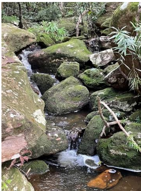
Photo taken on the so-called Sphinx Walk in the Ku-ring-gai National Park. It's a somewhat rough bush track starting at the Sphinx sandstone sculpture (made by a returned service man after his return from the war in Egypt) and descending to Cackle's Creek from whence you follow the creek to finish up at Bobbin Head.

Photo: Sphinx Walk (21 March 2022 - Ku-ring-gai National Park, NSW)