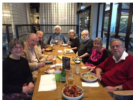
Parramatta Club (18 October 2022)