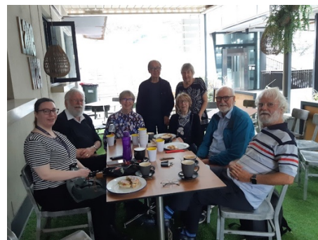
Sydney University (21 October 2022)