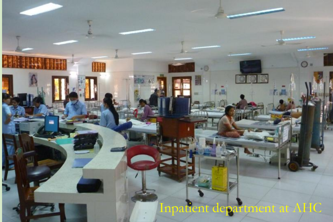
Inpatient department at AHC

AHC is an NGO paediatric teaching hospital in Siem Reap set up by a charity known as “Friends without a Border”. It provides free healthcare to Cambodian children under the age of 16.