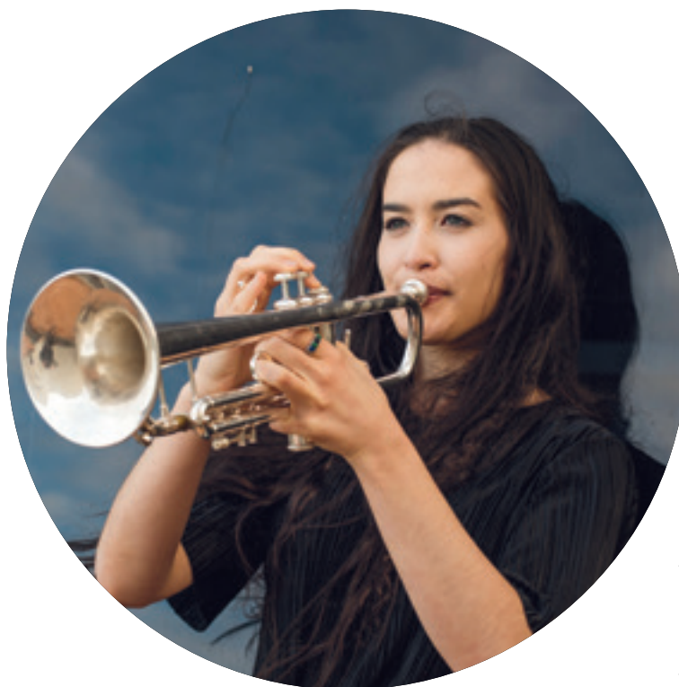
Bachelor of Arts (Music major)

For other sample progression tables, please refer to the Faculty of Arts and Social Sciences handbook: sydney.edu.au/handbooks/arts/subject_areas/music