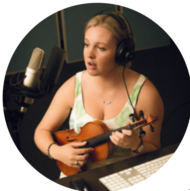
Bachelor of Music (Music Education)

For other sample progression tables, please refer to the Sydney Conservatorium of Music handbook: sydney.edu.au/handbooks/conservatorium