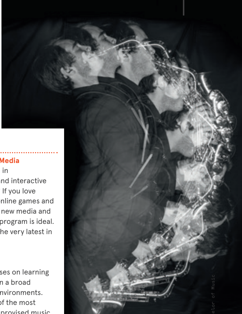
Bachelor of Music