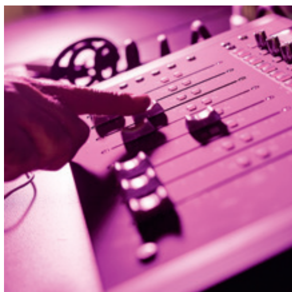
Sydney Conservatorium of Music