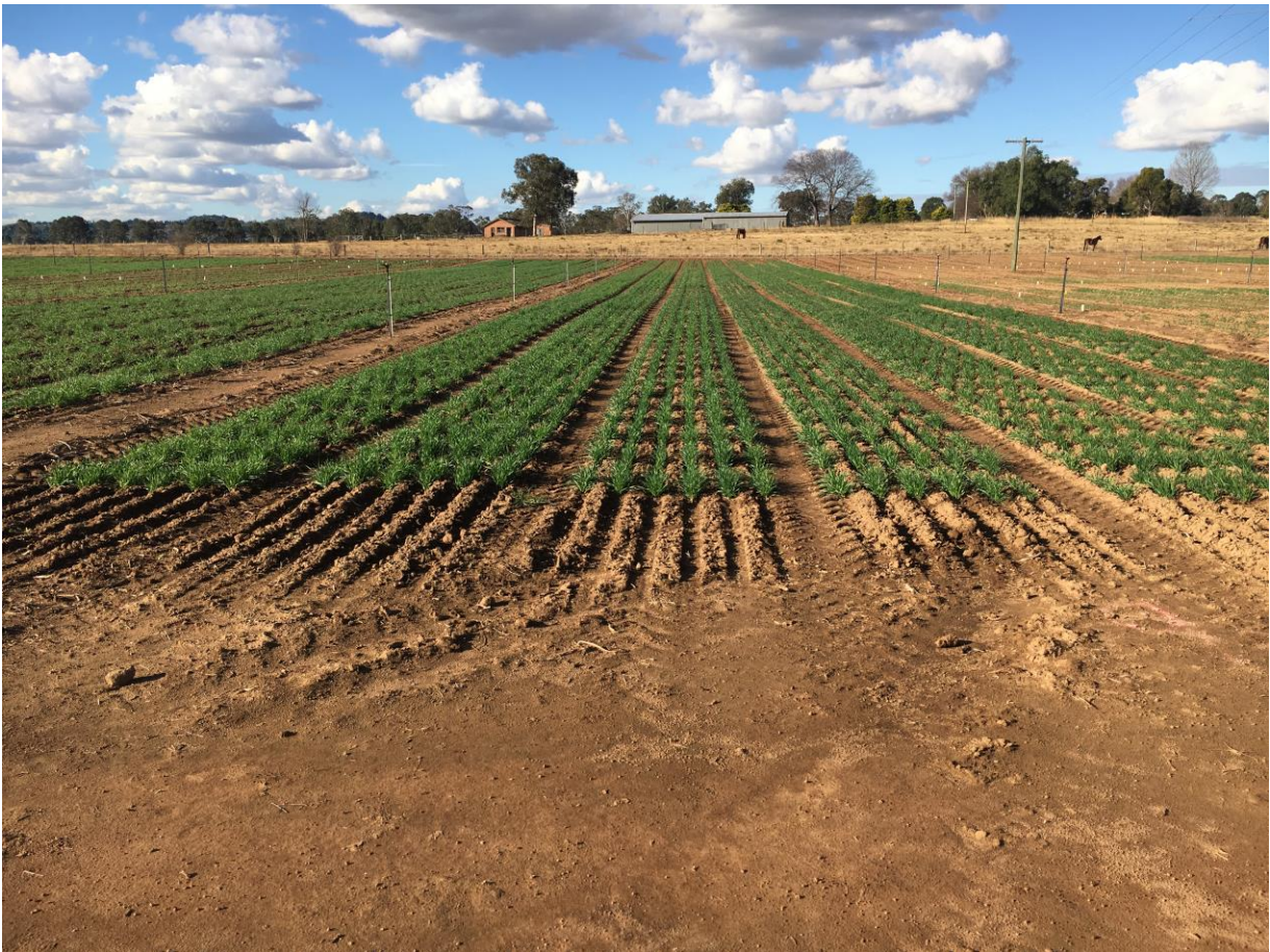
Field sowing: Wheat germplasm sown at Horse Unit field site, PBI Cobbitty

The Core set of wheat genotypes was assembled, and sown in the field at PBI, Cobbitty. Some additional lines imported from Nepal are currently growing under quarantine conditions at PBI and will be released towards the end of 2017. The development of genetic resources for the project, research populations and genetic stocks for monitoring the effectiveness of resistance in different environments, is now well underway. Crossing to initiate the development of the NAM population and NIL stock development has progressed with and some F1s already in hand. Initially, a range in the maturity timings of certain parental genotypes was a problem in crossing, which was resolved by using growth rooms developed with funds from the project to coincide growth stages. Rust phenotyping and marker assisted selection of BC 1 F 2 s is under progress for the next cycle of backcrossing required to develop NILs stocks carrying minor genes for stripe rust resistance.