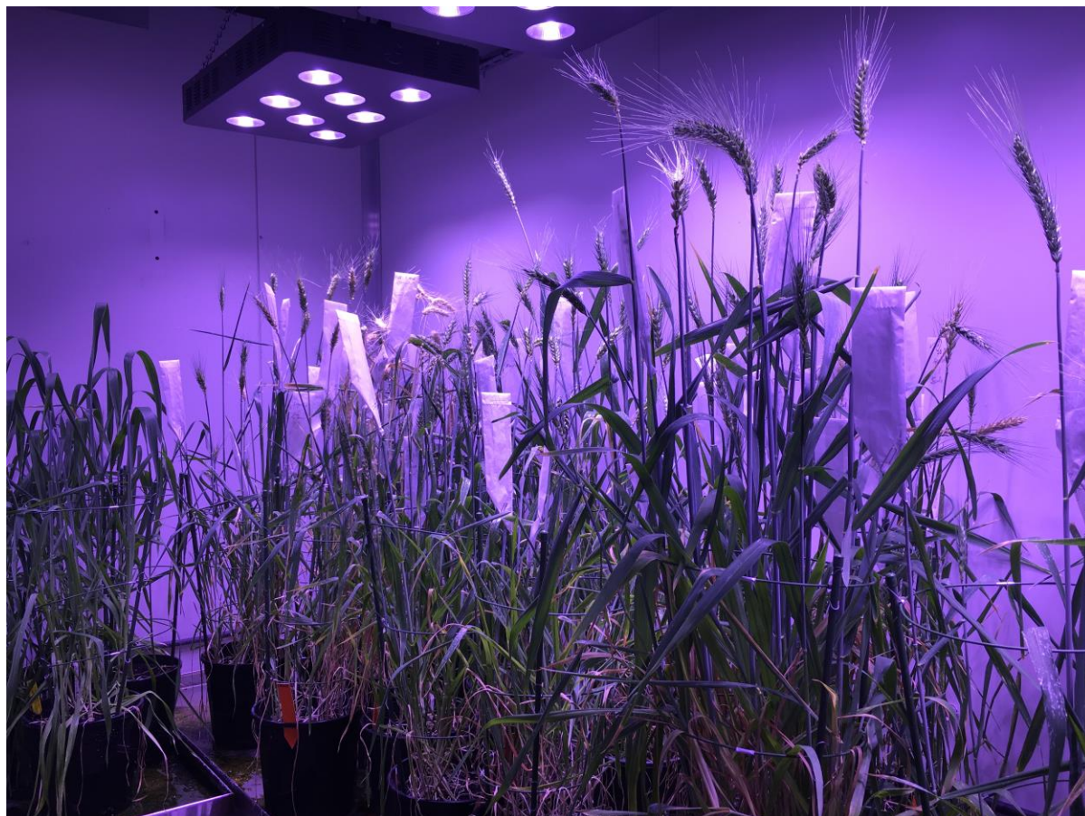
Crossing: F1s maturing in a growth room at PBI, Cobbitty

Nominations of trainees from each partner country; Ethiopia, India, Nepal and Pakistan have been received and the final list is being decided, with the first cohort of trainees expected to start training at PBI in early 2018. Each of the trainees will then assist in in-country germplasm screening to support local cereal breeding programs, in-country rust race analysis and the generation and maintenance of pure inoculum of important rust races for use in field selection nurseries.