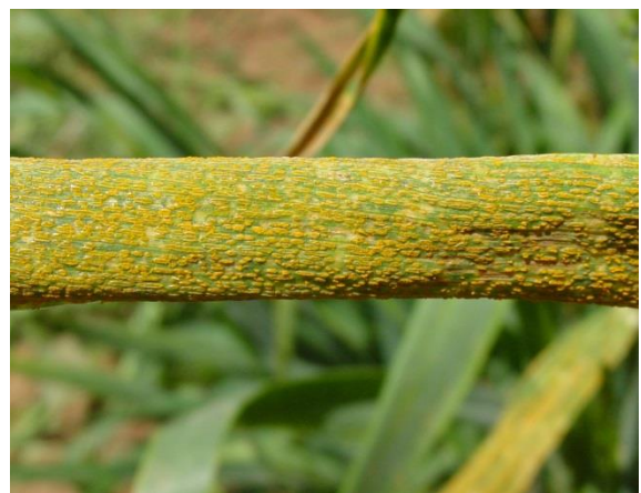
Figure 3. The disease response on the flag leaf of a susceptible wheat plant to wheat stripe rust.

stripe rust pathotypes avirulent for this gene. The expected response of such varieties is occasional necrotic flecks and no sporulation. If wheat stripe rust was caused by a pathotype with Yr17 virulence, the disease response of Mace would be susceptible-very susceptible (SVS, Figure 3). Given that the samples of wheat stripe rust off Mace have been within the observed distribution of the disease in Western Australia, and based on the information at hand, it is more likely that the crops sampled have not been from pure seed sources. Regardless, Yr17 is an important resistance gene in several wheat varieties grown in Western Australia. As a result, it is critical that growers closely monitor crops and submit samples of any rust observed to the Australian Cereal Rust Survey, regardless of variety.