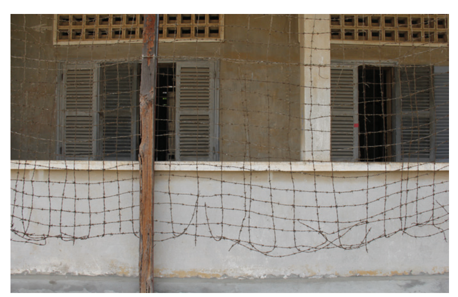
Tuol Sleng, Cambodia

"If you're interested in international human rights law, it's so important to understand what comes with the job: the experience of making a new home in another country, working and socialising alongside many nationalities, and dealing every day with some truly horrendous crimes. I found it very rewarding but it's definitely not for everyone."