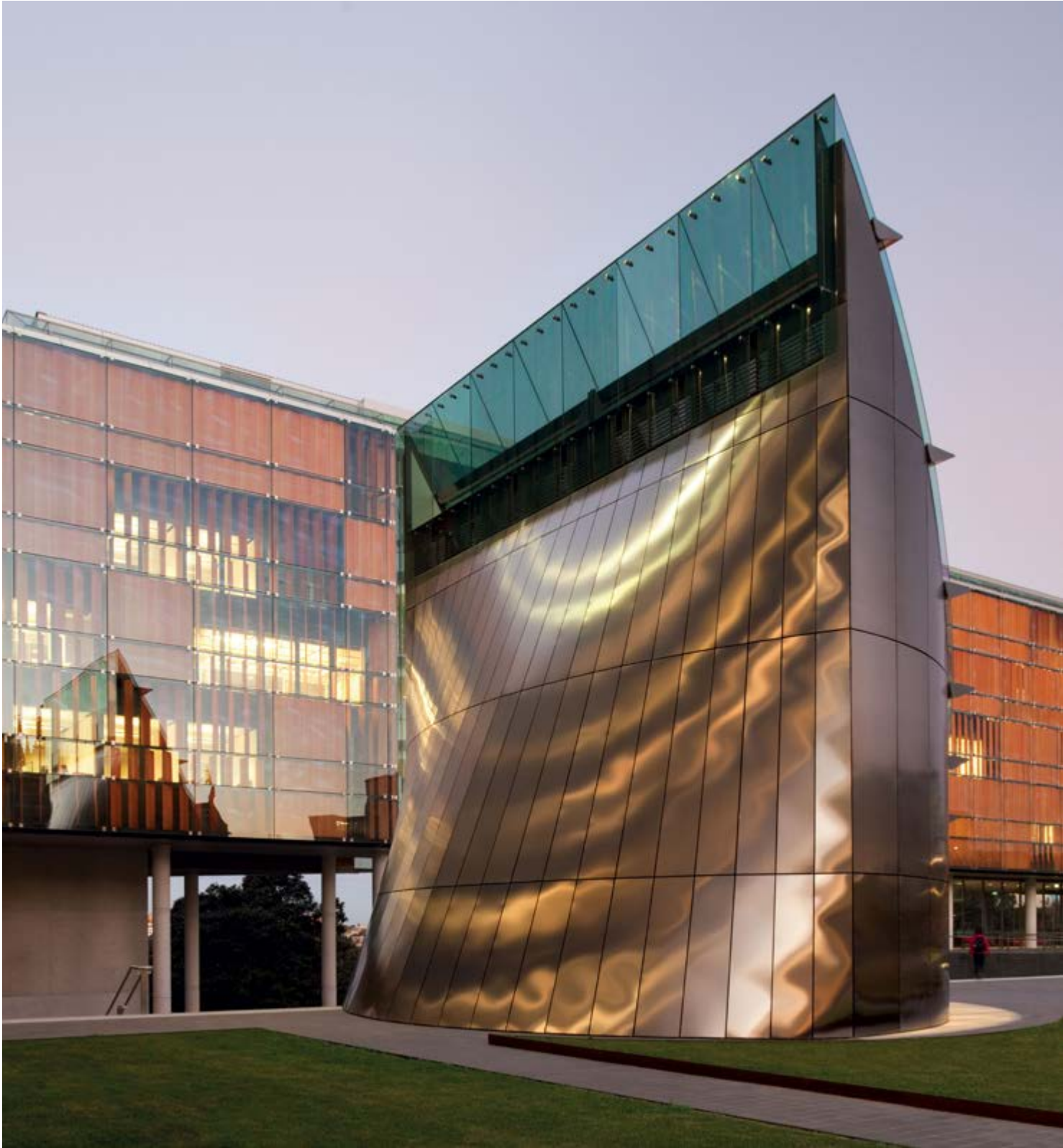
Light-tower in front of the New Law Building