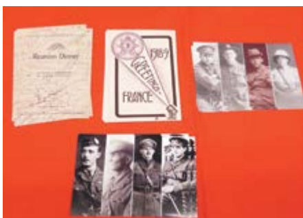
Left: Sydney Law School commemorative event held in April 2018