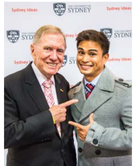
Opposite: SULS social evening Above: Launch of annual 'Race Journal' Below: The Hon. Michael Kirby AC CMG with student

SULS is grateful for the thriving Sydney Law School alumni community and optimistic about future generations. It has been a privilege serving and celebrating the Sydney law community this year.