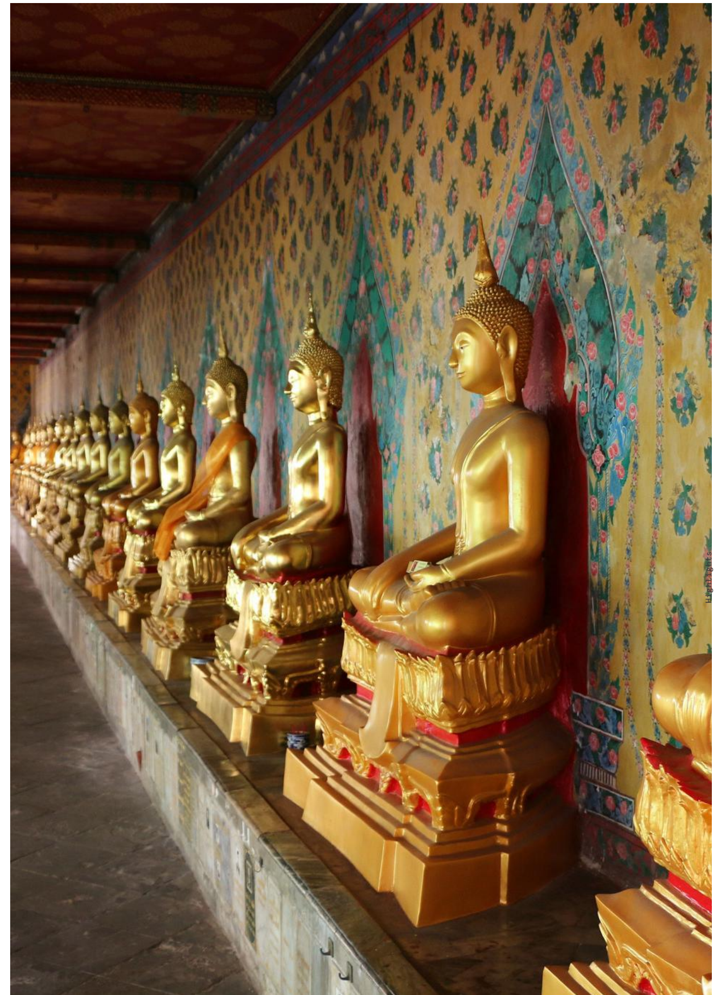
‘Thailand’

At a time when academic freedom is under threat in their home country, a symposium of this size and theme reaffirmed the relevance of their research and highlighted the strong support and interest in Thai studies at the University of Sydney.