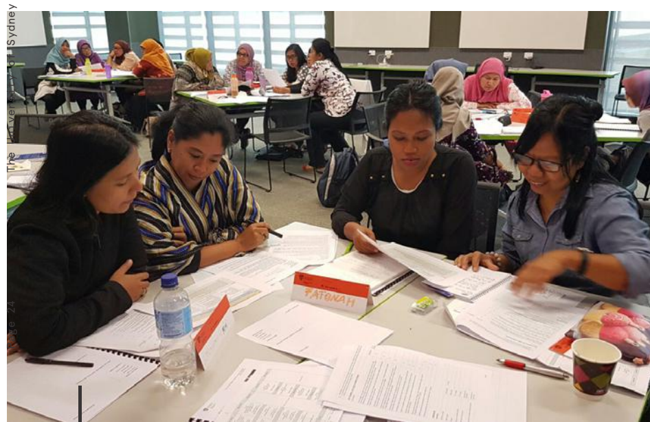
Indonesian women leaders at the University of Sydney

The partnership will also benefit University of Sydney students by providing in-country experiences with UNICEF, which has been a trusted development partner with the Indonesian Government for more than 60 years.