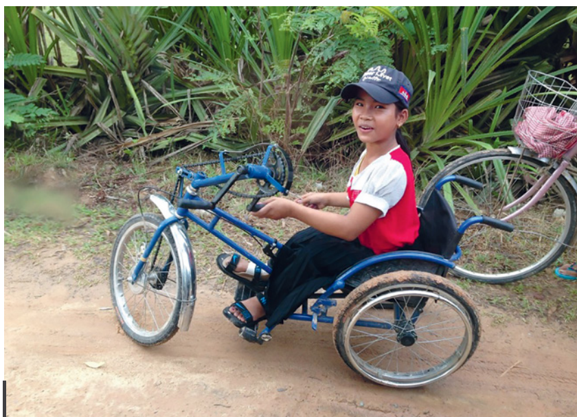
Disaster and Disability in Cambodia