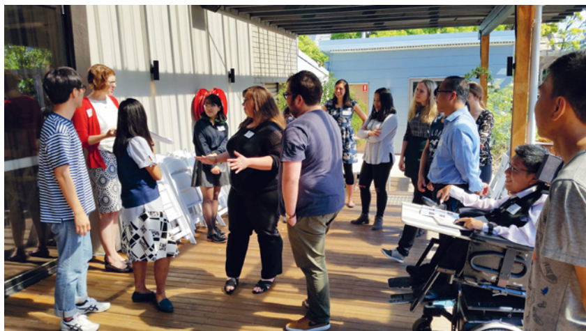
Participants at the postgraduate retreat taking part in an ice-breaker