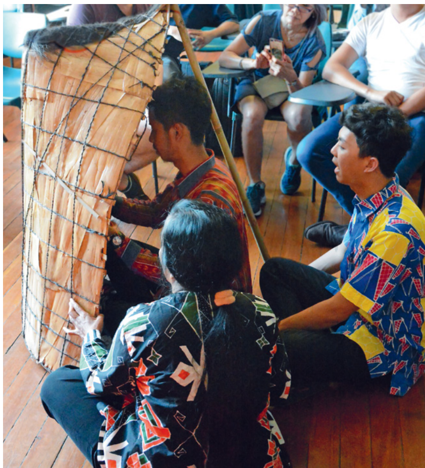
The Bundengan of Wonosoba workshop with Making Connections

Later in the month, SSEAC hosted the Sydney launch of the archive Bali 1928 Repatriation Project during