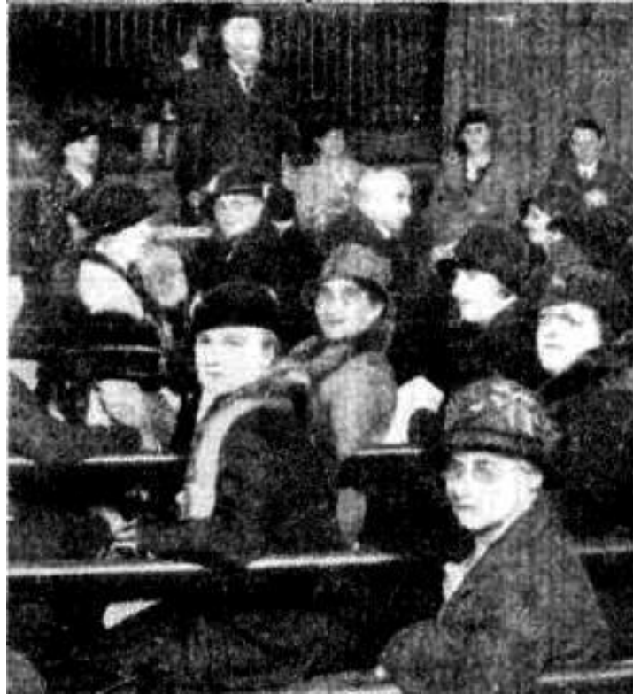
Sir William Cullen addressing the Sydney University Settlement annual meeting at Chippendale on 5 May 1933