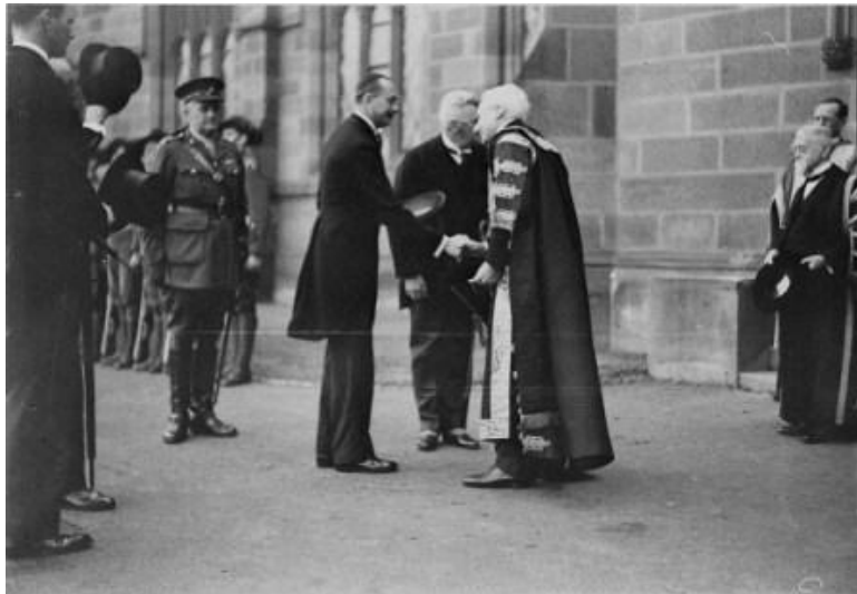
Chancellor the Hon Sir William Portus Cullen greets His Royal Highness the Duke of Gloucester before the ceremony to confer the degree of Doctor of Laws ad eundem gradum upon the Duke, on 23 November 1934, photo, Hood collection, State Library of New South Wales, HA 354.