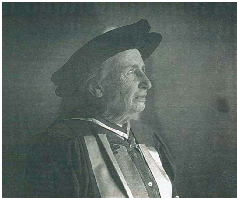
Rosemary Dobson AO, 'The University of Sydney News', 14 March 1996.