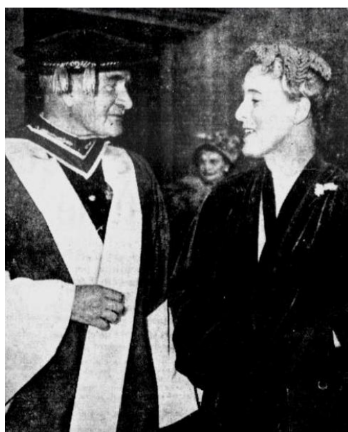
Sir William and Lady Slim, photo from 'The Sydney Morning Herald', 14 October 1953, National Library of Australia.