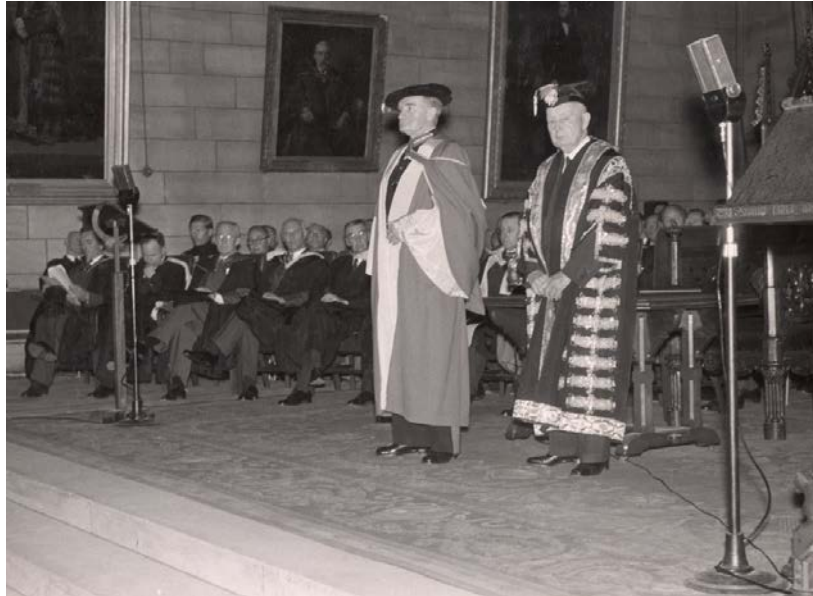
After the conferring of the honorary degree by the Chancellor (on right)