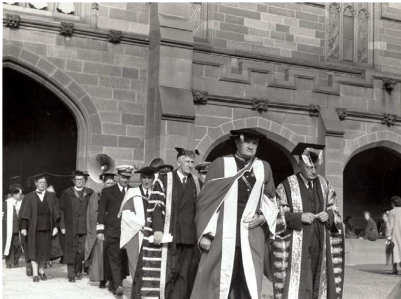
The academic procession after the ceremony