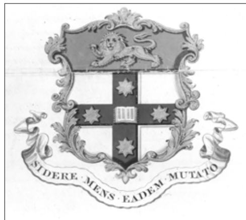
Detail of University Arms from the 1857 Grant of Arms.