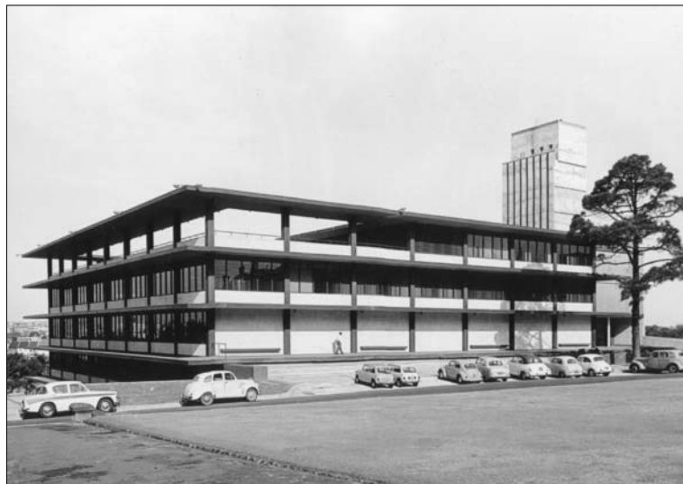
The new Fisher Library prior to the completion of the stack, 1965 (G3/224/94)

By a fortunate coincidence, Metcalfe's consultancy coincided with the federal government's appointment