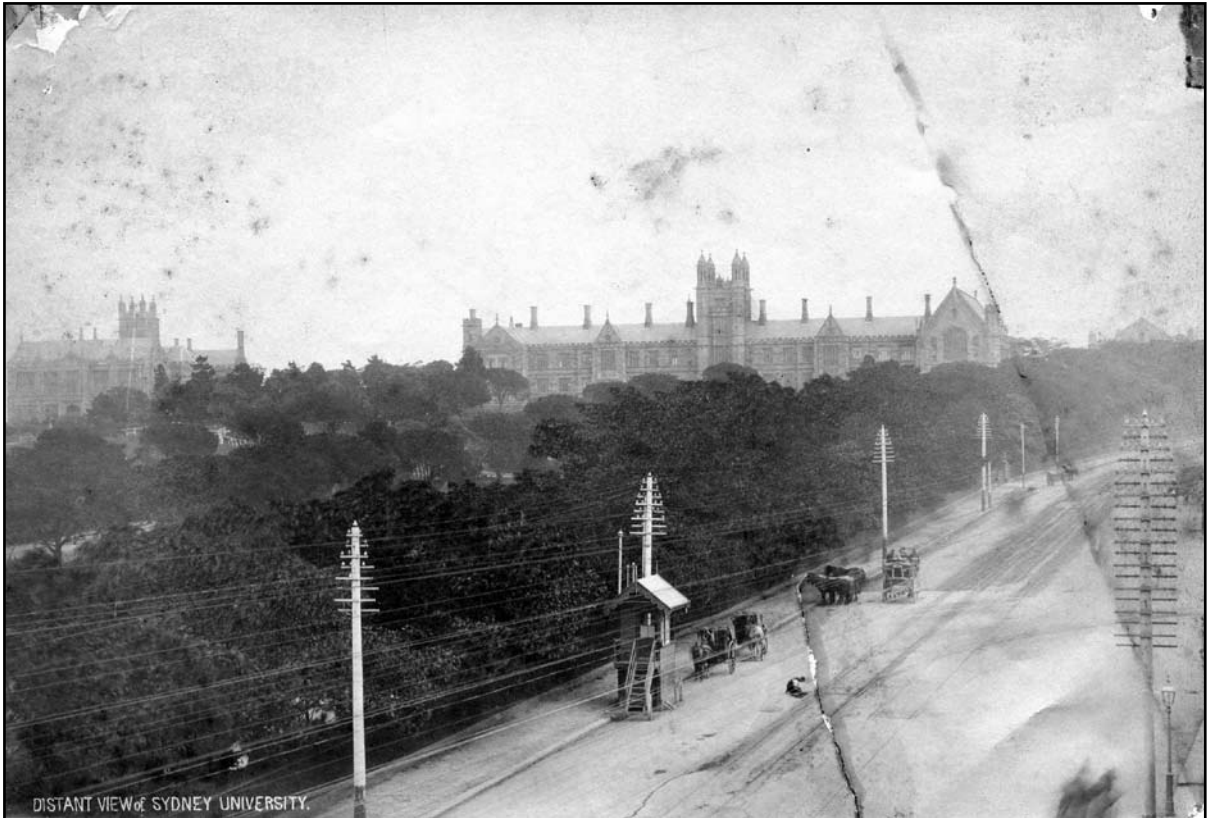
View of the University of Sydney from Broadway, c.1900 G3/224/48.