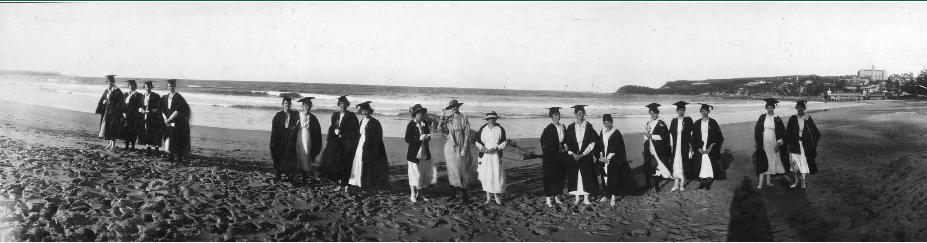
Cover image: Undergraduates at Manly Beach, 1919