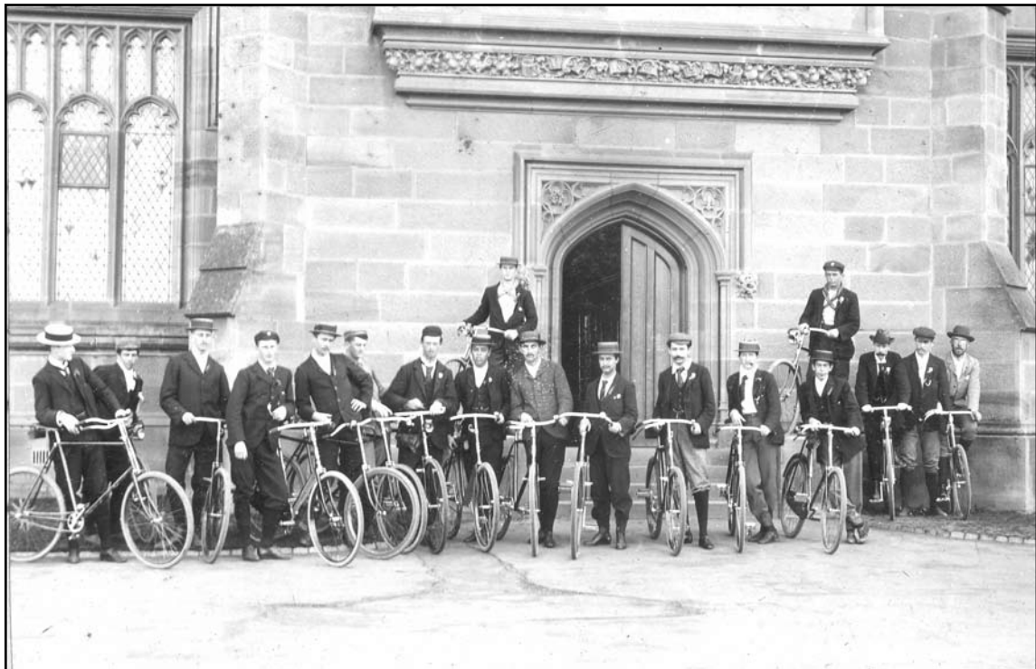
Opening run of the University of Sydney Bicycle Club, 1897. G3/224/1548

Sydney University Sport 1852-2007: More than a club offers a fascinating and highly informative overview of the history of sport at the University of Sydney. Sport at Sydney has had a complex and sometimes chequered history, with many clubs starting with promise, only to fold a few years later and perhaps to be revived many years later.