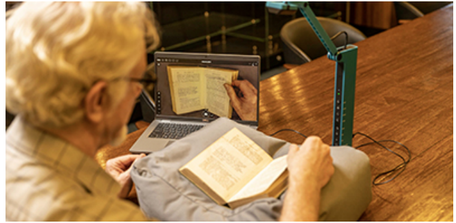
Virginia Woolf's 'The Voyage Out' being viewed on the VRR.

Want to read one of our rare books but can't make it to our in-person collection? With the Library's Virtual Reading Room (VRR) , you can request items from the Rare Books and Special Collections to view online.