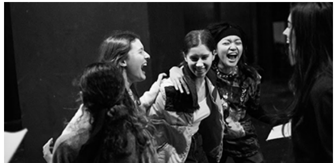
Rehearsal for 'Play On'

Love sport and a good murder mystery? Then you'll love Sydney University Dramatic Society's (SUDS) latest work, 'Play On' – a play about netball and a murder mystery that'll keep you on the edge of your seat. See 'Play On' at the Cellar Theatre from Wednesday 2 to Saturday 12 August.