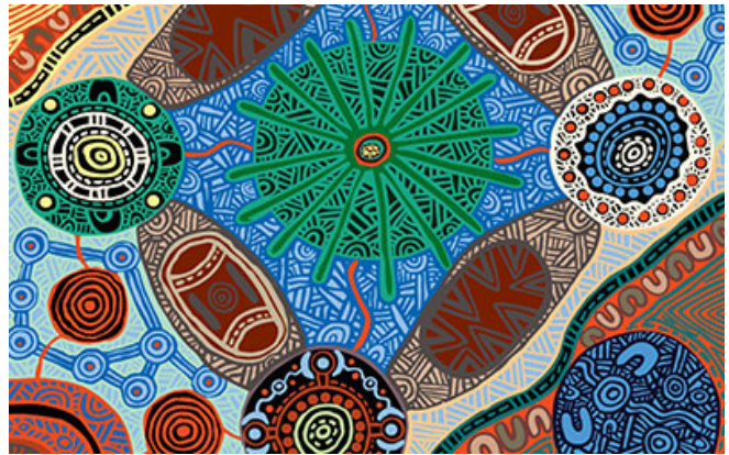
Artwork by Luke Penrith

The Library is commissioning a creative work to connect our digital and physical spaces to Country. Proposals from established or emerging Aboriginal and Torres Strait Islander artists are welcome – express your interest by 15 September 2023 .