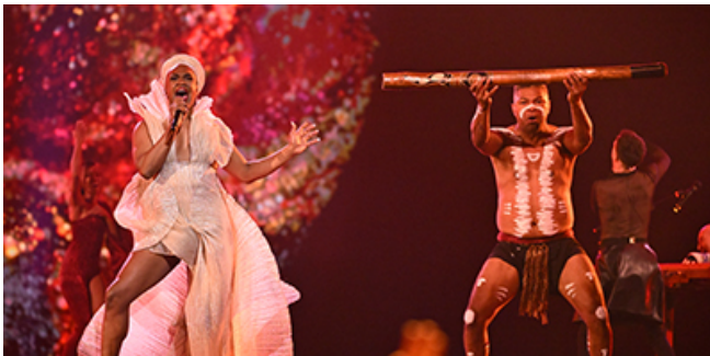
Electric Fields at the 68th Eurovision Song Contest at Malmo Arena in Sweden.