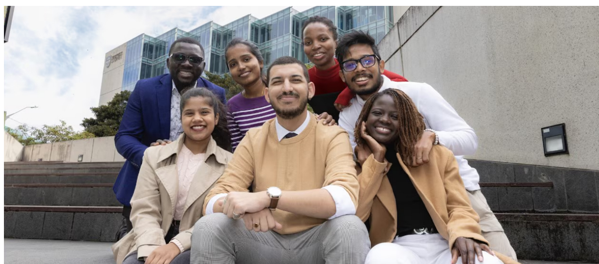
Scholarship winners.