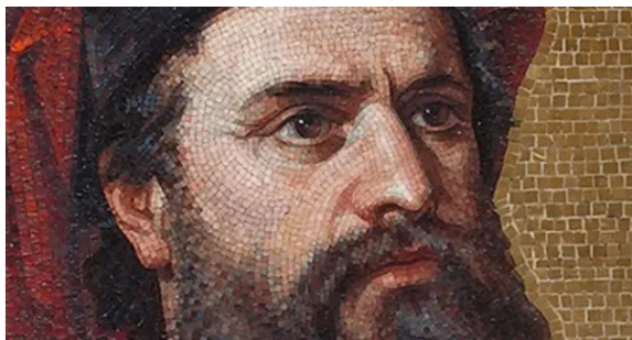
Marco Polo, the name behind the game.