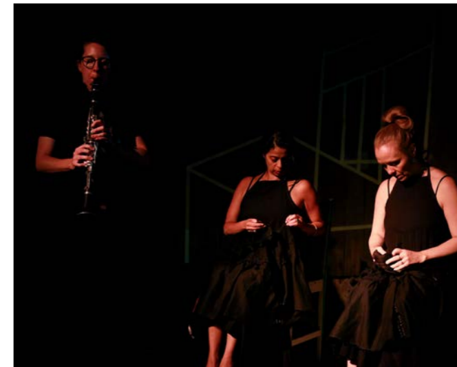
'Lola stayed too long'

On arriving in Sydney on January 4, our first task as collaborators was to find a common language, to create a space, in which we could meaningfully interact.