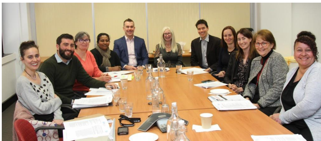
NSW Supported Decision-Making interest group (2017).

Interest group membership was established during late 2016, with the initial meeting in each state convened in early 2017. The groups met approximately quarterly until mid-2018, with each group meeting five times. Meetings were 2-3 hours in duration with minutes taken by the investigator team (secretariat or chair). Project grant funding was used to cover appropriate expenses for interest group members, subject to an agreed 'terms of reference' document, which was established as part of the first meeting. This included payment of sitting fees for consumer/lived experience representatives. Consumer/lived experience representatives were also eligible for involvement in dissemination activities.