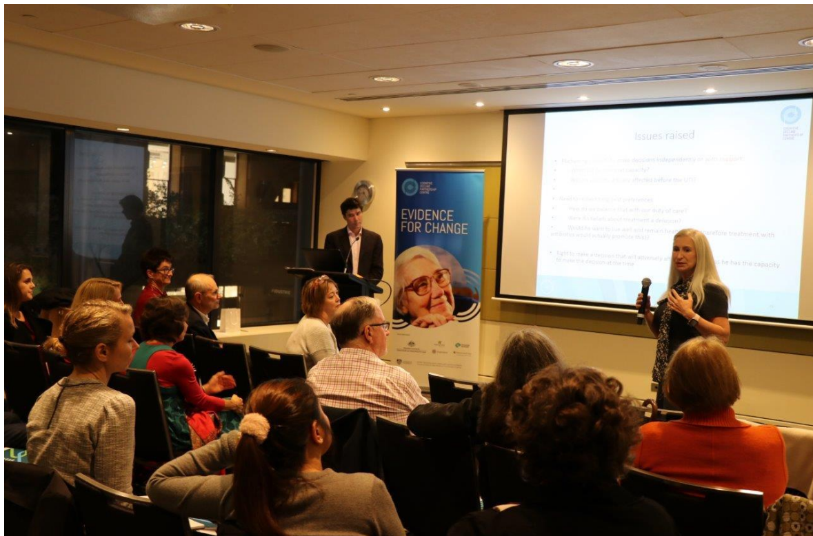
Launch of the ‘Supported Decision-Making in Aged Care’ Policy Development Guideline

Since the launch of the document, more than 950 copies of the resource have been distributed to a range of key stakeholders across Australia. The policy guideline has been cited by the Aged Care Quality and Safety Commission, as a resource for aged care providers to use in demonstrating their compliance with incoming aged care standards (particularly Standard 1 ‘Consumer Dignity and Choice’ and Standard 2 ‘Ongoing Assessment and Planning with Consumers’). The NSW Public Guardian’s office has provided a direct link to this document from their website section “What is Supported Decision-Making (SDM)”.