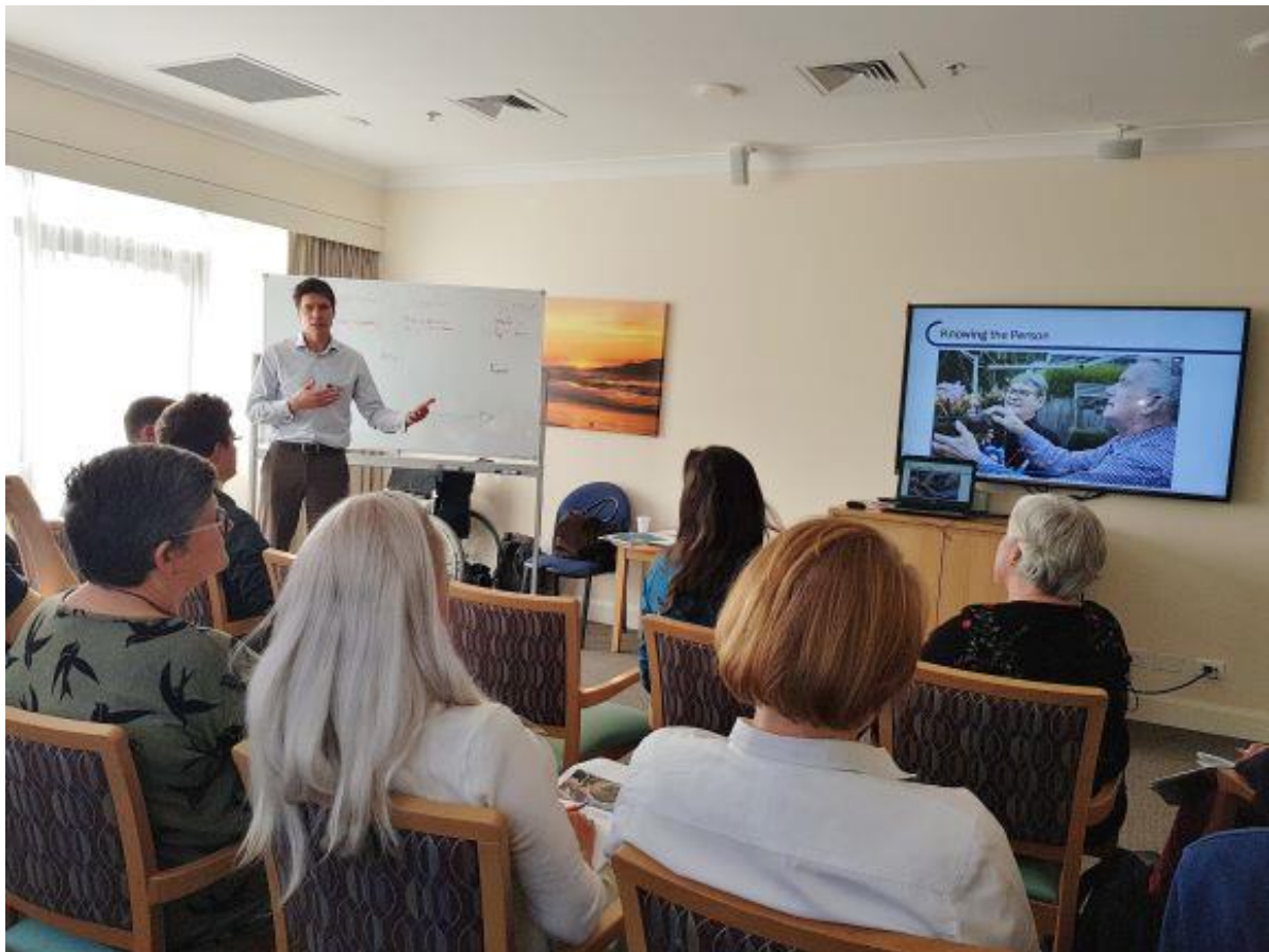
Pilot supported decision-making training package session

across NSW and WA. Two additional ‘train-the-trainer’ sessions piloted an approach to equipping staff champions to implement the training materials more broadly across their organisations. During 2019 remaining project funds were utilised to expand the training package (additional 11 sessions), running further sessions with aged care providers across NSW (in partnership with the NSW Public Guardian) and evaluating the package more formally.