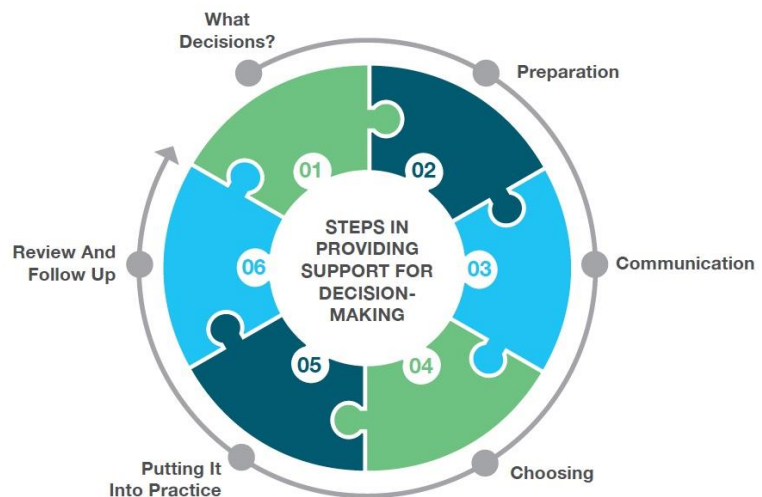
Supported decision-making consumer guidebook and 'decision-making steps'

Over 1000 copies of the consumer guidebook have been distributed by CDPC team members to key stakeholder organisations (e.g. older person's rights groups, Dementia Australia, partner aged care provider organisations, Carers Australia branches) during 2018 and 2019.