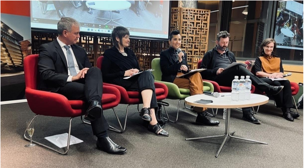
Pandemic Policing Panel, 2022