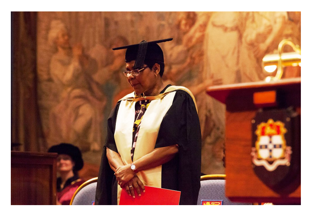
As the citation is read out